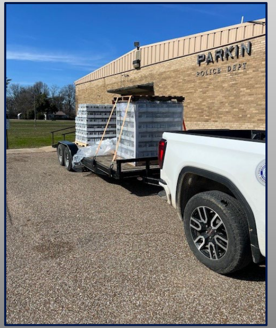
Local OEM water delivery